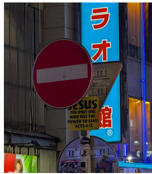
Jesus in Shibuya!