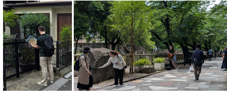
We are regularly distributing flyers around our church and occasionally perform in a nearby park!

I also now have an opportunity each month to share a message with the Church, which I am honored to do. Soon there won't be a translator needed for this either!