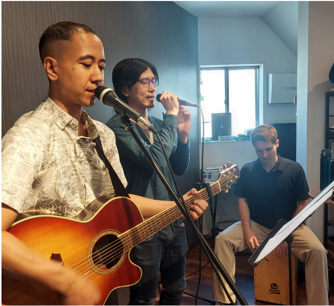
Piano isn't all I can do! Some weeks the music calls for a Cahon!