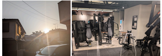
Above: A small, post church celebration for one of our members who moved across Japan to take new job!