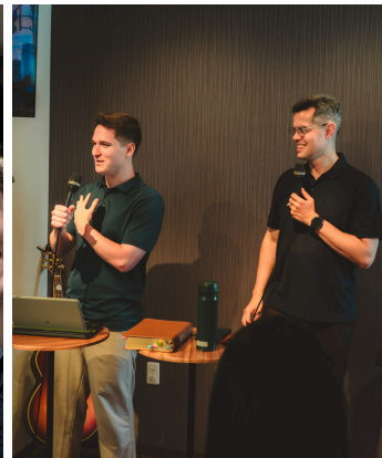
First message given at the church!