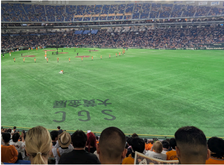
First time at a Tokyo Giant's Baseball game, tickets are less than $15!