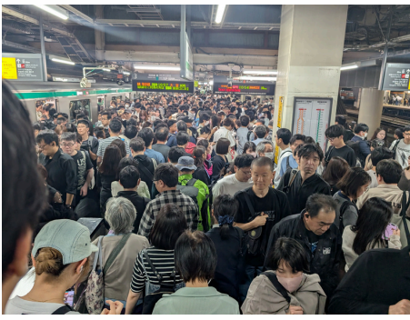
You can't be scared of crowded spaces if you want to serve in Tokyo!