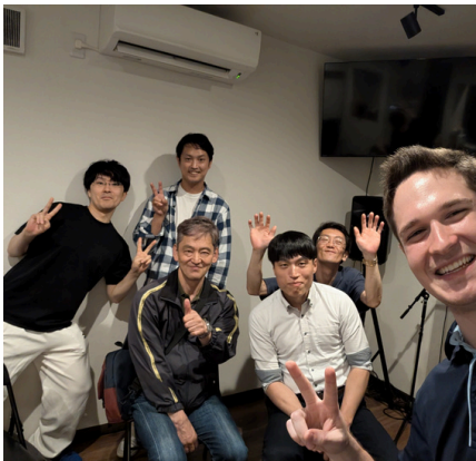
English conversation class I teach every monday!

Outreach is a constant topic of thought and consideration for missionaries in Japan. Many long-term missionaries consider corner-side preaching an ineffective method to reach the Japanese people for Christ. While I understand their view, it's still necessary for the Japanese people to hear the message of Christ. Nowadays most would argue the most effective method for the Japanese people is 1 on 1 long-term personal relationship to personally share the gospel. Since the gospel is still currently quite counter cultural, it takes a lot for many Japanese to make the 'jump', and many end up losing relationships with family and friends for it. As difficult as it may be, Jesus does expects us to make sacrifices, as many of us that endure that battle of faith know, it's worth it in the end.