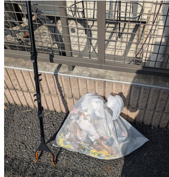
First haul of trash pickup Saturday!