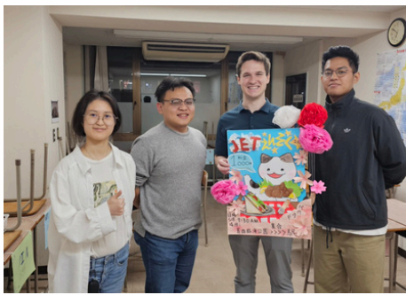
The student staff team creating the poster for JET's big summer outing!