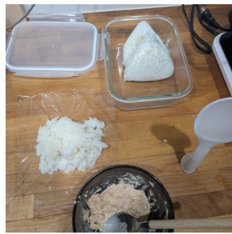
My new favorite lunch! Tuna-mayo Onigiri