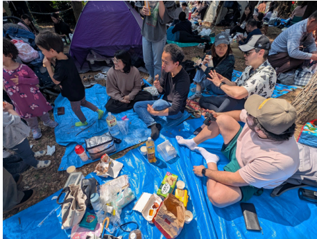
Church leadership picnic at a local park during sakura viewing season.