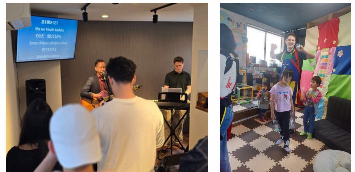
Playing on the Worship Team at Word of Life Tokyo, and serving in the Kids Class!