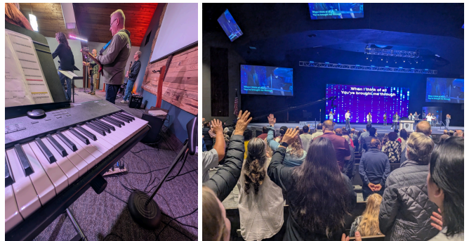
Playing on the Worship Team at Chisago Lakes Maranatha, and some praise and worship at Rhema Winter Bible Seminar

There was much to be done before moving, however. My organization had to be approved as a 501(c)(3) to receive donations, I had to raise monthly support for living in Japan, not to mention I still had to get my visa! Non-profit status was acquired, I spent months itinerating and sharing the mission with family, friends, local, and not-so-local churches to raise support. Finally in late February I received notice that I was eligible for a visa, all I had to do was apply at the Consulate-General of Japan in Chicago and I was good to go! Or so I thought. The day I received notice I could apply, I drove to the Consulate and dropped off my application for the Visa. All I had to do was wait 5 business days and they would ship me back my passport with the visa inside! It was to arrive on the 3 rd of March and I'd leave on the 9 th . Plenty of time!