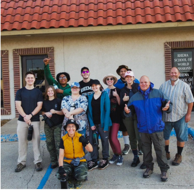
World Missions Class Photo before our Survival Training Week