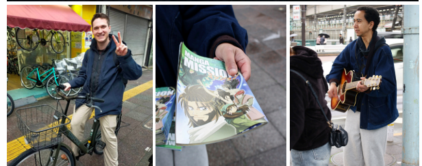
Mt. Fuji, my new bike, and some public worship!