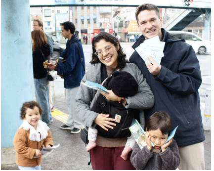
Outreach at Oji Station in Kita City with the Word of Life Tokyo team! We pass out tracks, play and sing with a guitar, and uplift the atmosphere in this busy city!