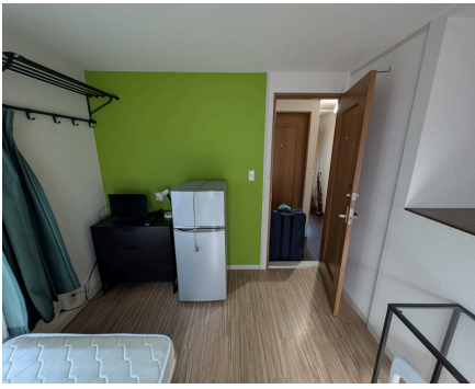
My new room in a shared house