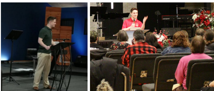
Ministering and sharing the mission in U.S. churches

Unfortunately the postal service decided to play hot-potato with my passport bouncing it around wrong post offices causing the new date of delivery to be... March 9 th . With a flight at 10am I didn't have time to wait for it to be delivered! Yet I know God always provides a way. 24 hours before I'm supposed to board, I go to check-in online and get a message that because my flight is so full, they are looking for volunteers to switch to the next day's flight. Yes please!! Because it was a volunteer basis, I didn't have to pay the fare difference of over $600, Praise God! Monday I picked up my passport with my new visa, and left without interruption the next day.