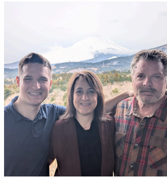
Showing my parents Mt. Fuji